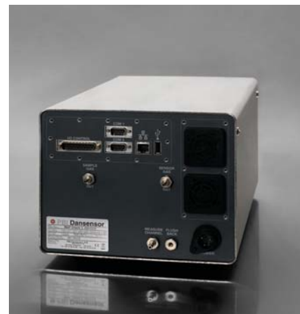
PBI-DS-Dash-gastec-MAP Check 3-EN-2