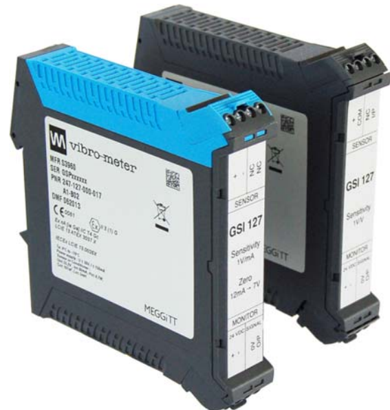
GSI 127 (Ex approved and standard versions)