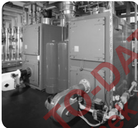
For adjusting gas burners