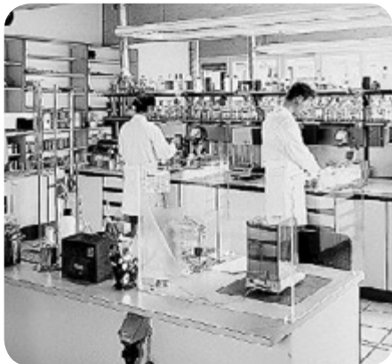
For pressure and vacuum measurements in a laboratory