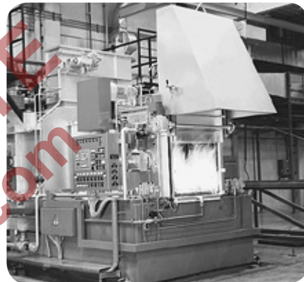
For process control, e.g. on forging furnaces