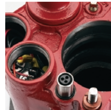
Pre-installed capacitor and simple electrical connections

With The Red Jacket Submersible Turbine Pump you turn off the circuit breaker, then simply back off the two nuts holding the extractable in place and the yoke electrical connection is broken. After service is complete, the electrical circuit reconnects when the two nuts are retightened. Safe, simple and easy.