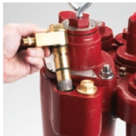
Red Jacket Vacuum Sensor Siphon System