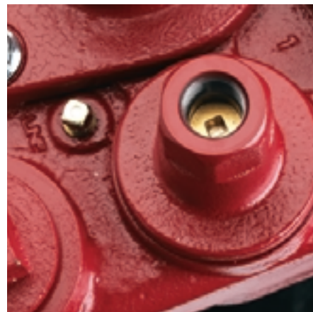
Check Valve pressure release