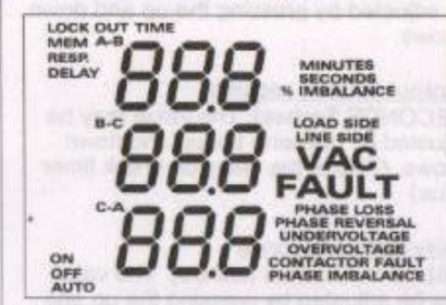
The DTP-3's LCD DISPLAY

display the normal AB BC CA voltage pairs.