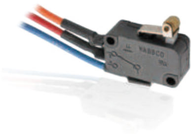
A V3 SPDT (single pole double throw) mechanical switch (Form C).