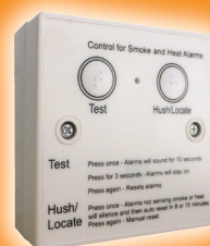
Wired Remote Test and Hush Unit