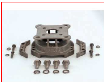
NAMUR 30x80x30 mounting pattern