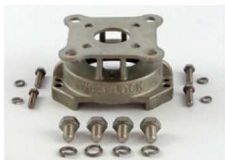
NAMUR 30x80x20 mounting pattern

Replaces current part numbers BAA2087N/BAA2087NS4/BAA2087NS6 BAA2088N/BAA2088NS4 BAA2090N/BAA2090NS4