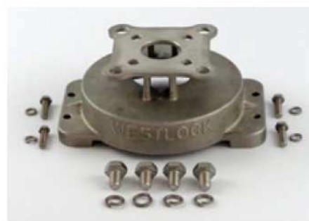
NAMUR 30x130x30 mounting pattern