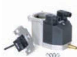
2. Remove the top part