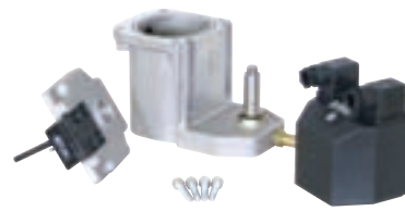
3. Slide off the electronic module