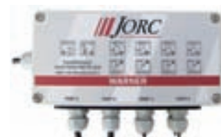
The KAPTIV-CS can be connected to the JORC WARNER ® (consult factory for more information).