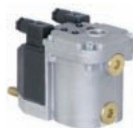
Multiple (3) inlet options