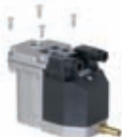
1. Unscrew the 4 bolts