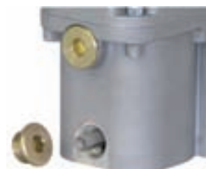
Integrated mesh strainer to protect the valve.