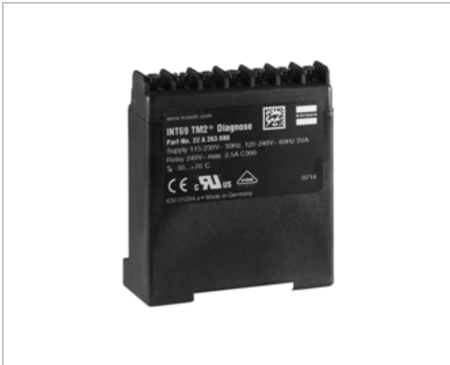
INT69 TM2 Diagnose